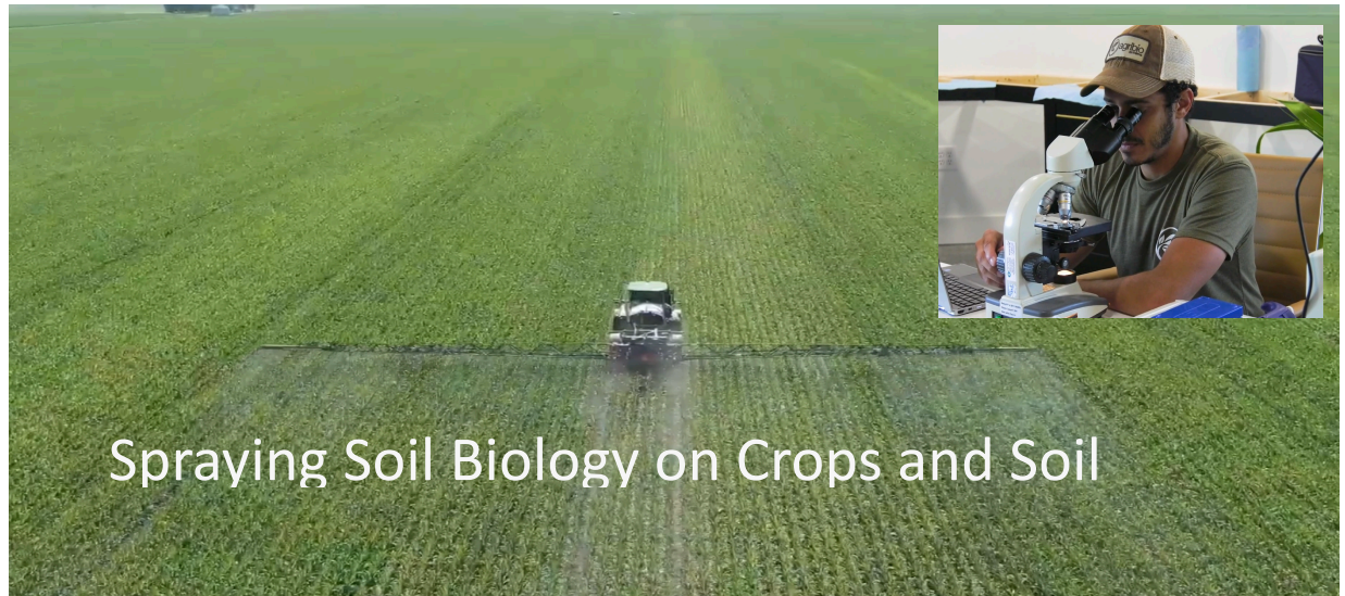
Spraying Soil Biology on Crops and Soil